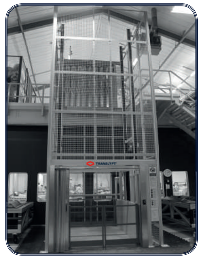
Contact us for specialized solutions in e.g. stainless steel, ATEX, or customized measurements.