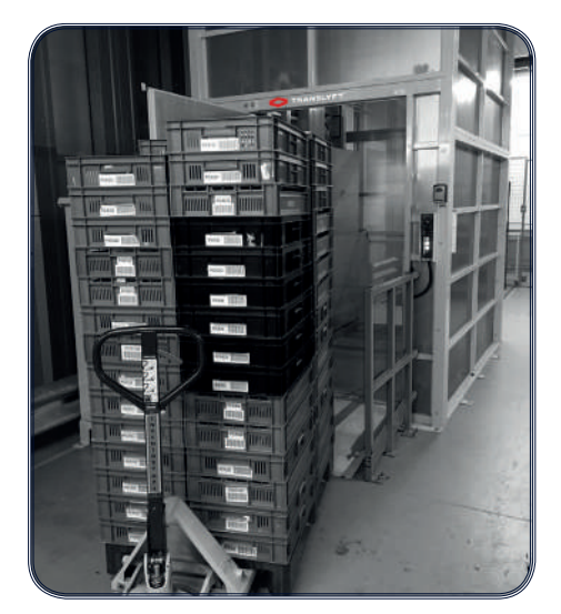
The Mastlift is ideal for general material handling between floors, and we can deliver it in the size you require.