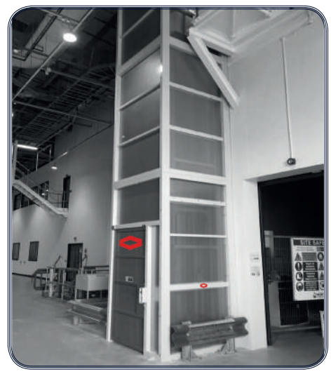
The Mastlift is fitted with our freight elevator control which includes autolevel system and soft start / stop.